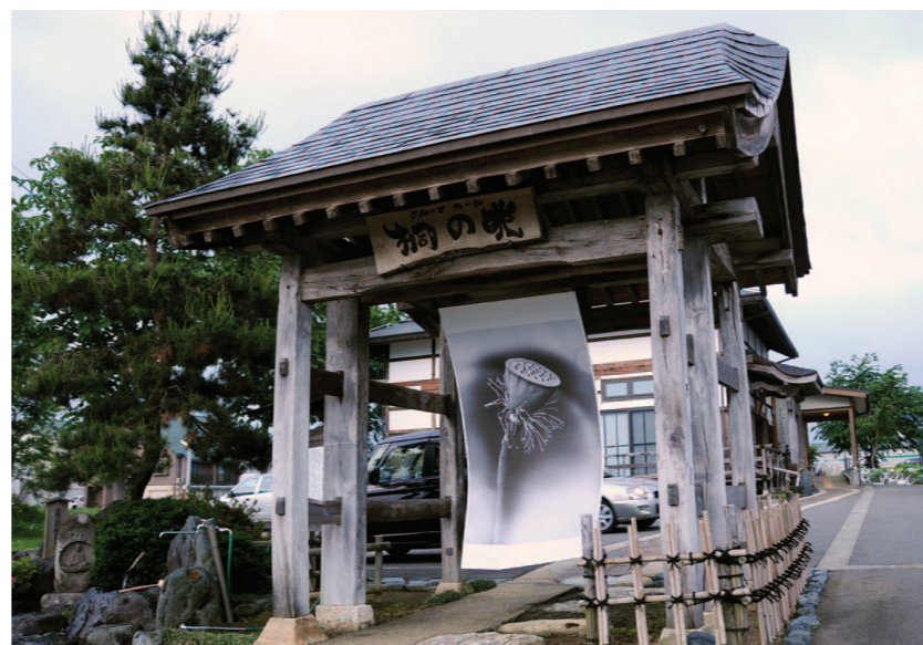
Iznad površine III, digitalni print na washi papiru, instalacija, 1x2 m, Musodo hram, Niigata, Japan 2011.