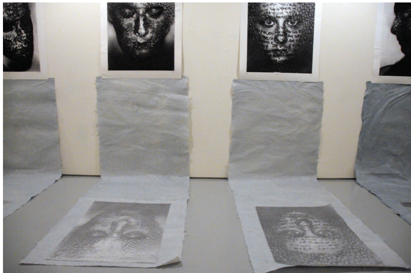
We're All Made of Stars I, II, III, IV fotografura, jetkanica, ručno pravljeni papir, Galerija Zero Hachi, Tokio, Japan, 2011.