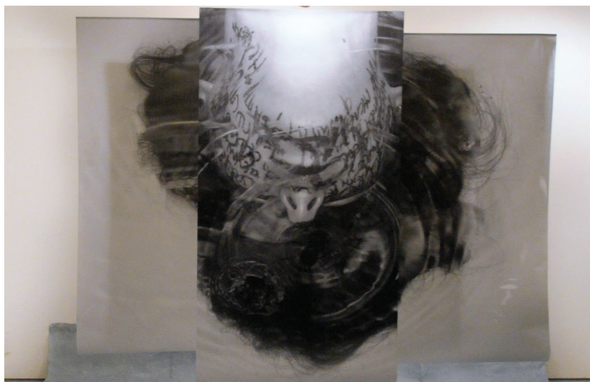
sora/ sky/ nebo, digitalni print na washi papiru i ručno pravljeni papir, instalacija. 3x3 m, Galerija Zero Hachi, Tokio, Japan, 2011.

Tri ciklusa predstavljena na ovoj izložbi obuhvataju tri istraživačka polja u okviru grafičke umjetnosti Taide Jašarević. Prvi ciklus preispituje semantiku grafičke forme i procese nastanka i transformacije slike. Drugi ciklus istražuje odnos materijala i prostora, grafičke forme i instalacije, a u trećem ciklusu postavlja se pitanje komunikacije između djela i posmatrača u zavisnosti od prirode prostora u kojem se komunikacija dešava (sakralni i sekularni prostor, prostor hrama i prostor galerije).