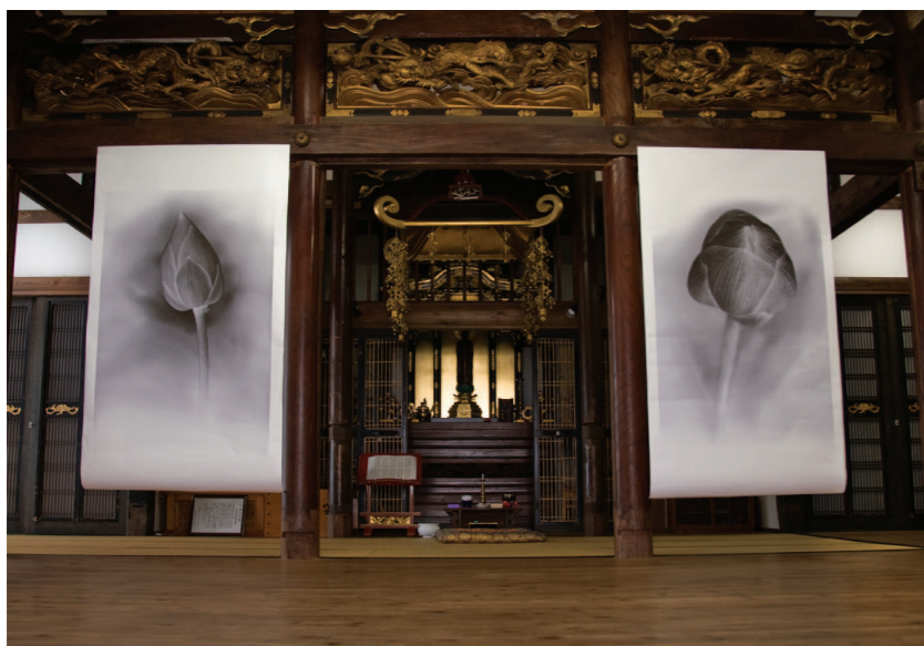
Iznad površine I i II, digitalni print na washi papiru, instalacija, 1x2 m, Musodo hram, Niigata, Japan 2011.